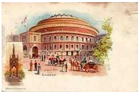
Postcard of the Hall (circa 1903) with an inset of the Albert Memorial .

In 1851, the Great Exhibition was held in Hyde Park, London, for which the Crystal Palace was built. The exhibition was a great success and led Prince Albert, the Prince Consort, to propose that a permanent series of facilities be built in the area for the enlightenment of the public. Progress on the scheme was slow and in 1861 Prince Albert died, without having seen his ideas come to fruition. However, a memorial was proposed for Hyde Park, with a Great Hall opposite.